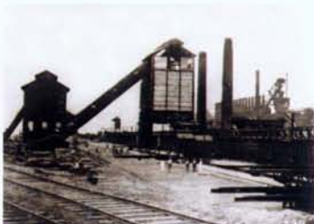
A general view of the Coke Oven Plant of Tata Steel – image circa 1911.

In 1935, he contracted dysentery at Baghdad, from which he never fully recovered. He died at his home in New York City, of pneumonia, after a short illness, and was buried at Rock Creek Cemetery, Washington, D.C.