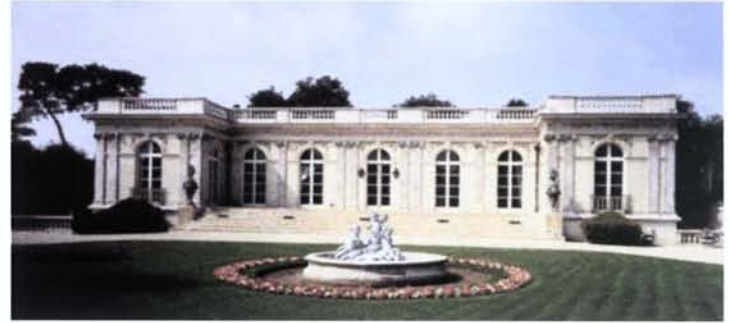
Le Palais Rose, Le Vésinet, France.

reproduces the rectangular plan, with its advanced side-doors and arched windows separated by pilasters of