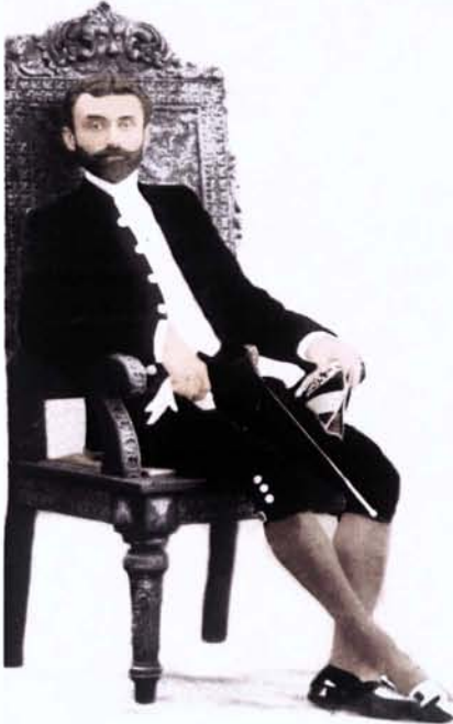
Sir Ratan Tata - image circa 1900 - digitally enhanced 2009.

Just outside Paris lies the pleasure palace of Versailles. This majestic shrine to the glory of the French monarchy was once the carnival ground of an earlier epoch. Rivaling the Royal Palace itself in grandeur are numerous outbuildings and pavilions. One of the most notable is the Grand Tranion. In 1899, this single storeyed structure, with a façade of pink and white marble, served as a model when an affluent engineer, Arthur Schweitzer, commissioned a private home built in Le Vésinet, the exclusive Parisian suburb, about ten miles west of the city. It