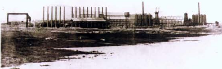
A view of the Tata Iron and Steel Works, Sakchi - image circa 1911.